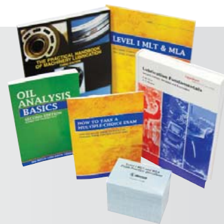
Preparation Tools For ICML Level 1 MLT And Level 1 MLA